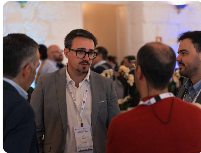
Networking at the 2026 Summit in Porto