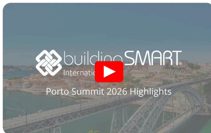
Watch previous Summit highlight videos

BIM Manager · CEO · Architect · Product Manager · Director · Managing Director · Engineer · Professor · Researcher · Senior Engineer · Chair · Project Manager · BIM Coordinator · President · BIM Consultant · Senior BIM Manager